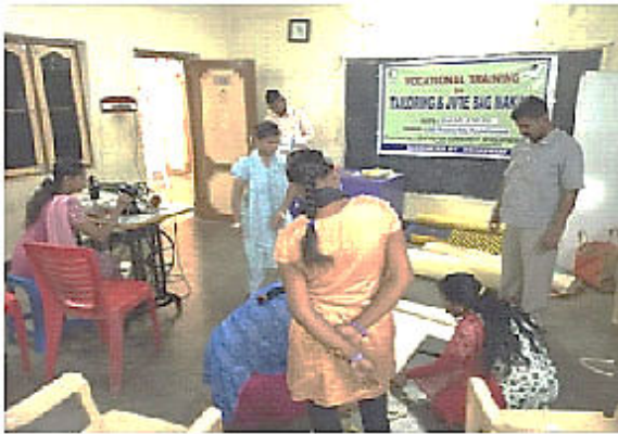
Refresher training on Jutebag stitching