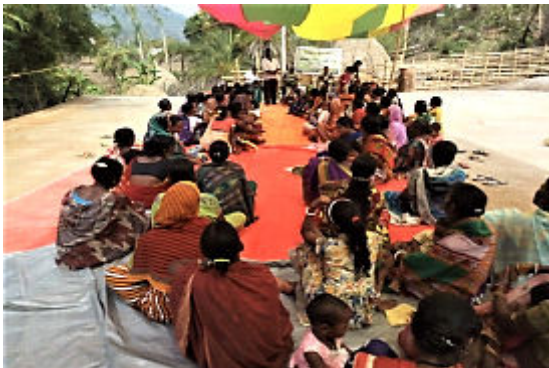
Training to SHG members on Business development plan