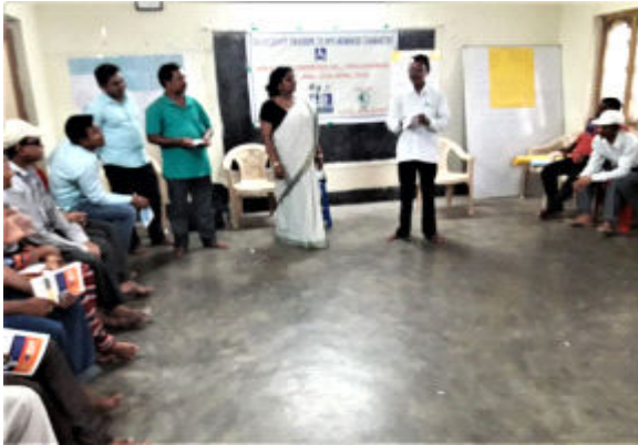
Leadership training to DPO members