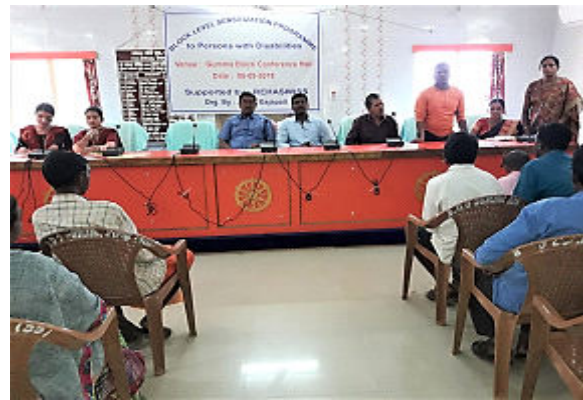
Block level training to DPO members