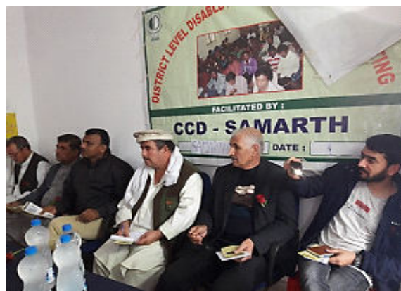
A team of Afganistan DPO network visited SAMARTH DPO, Gajapati