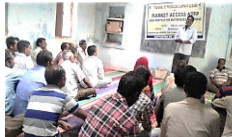
Training to the members of Producers Company