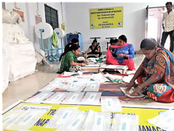
Training to DPO members on Sanitary Napkin preparation