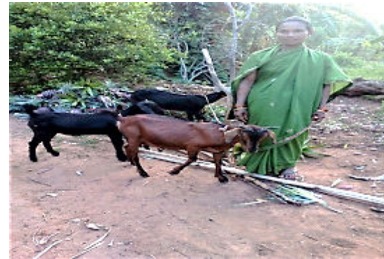
Matching grant support to the poorest of the poor families