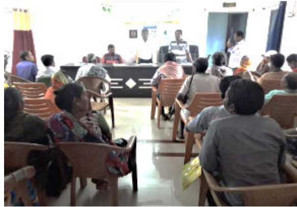
Block level workshop for DPO members