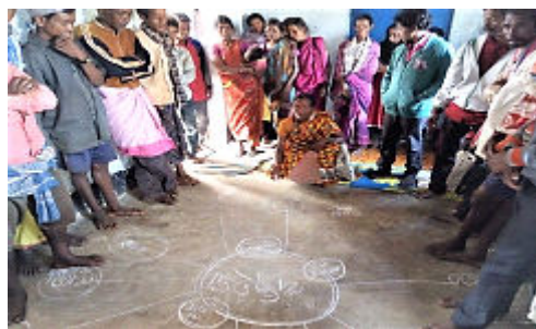
Village level microplanning