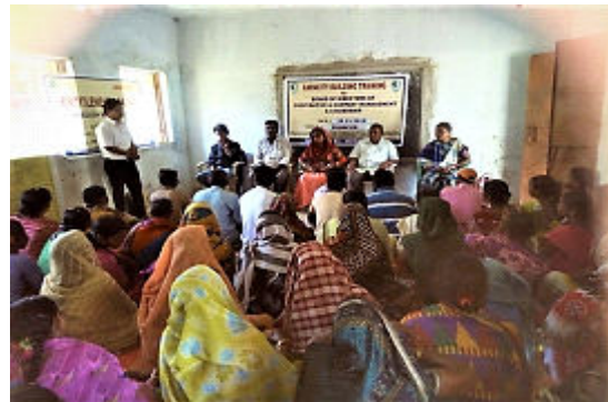
Leadership training on company management