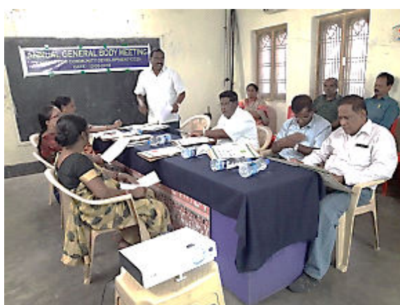
Annual General Body meeting of CCD

CCD has been maintaining the good governance practices by holding regular board members meeting and taking the views of board members to strengthen organizational governance and good affairs of the organization. The Board members are visiting the activities of project areas and also making feedback for the effective results of development programmes at the community level as well as organization level. Annual general board meeting is conducting once a year and Executive committee meeting is conducting twice - thrice in a year to make more reflection of organization activities. The project Coordinators are presenting annual progress during the board meeting.