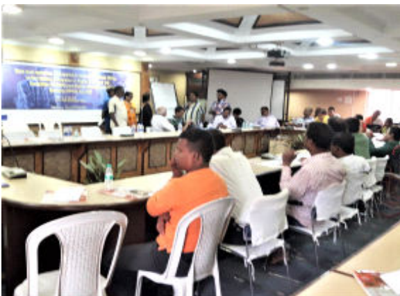
State level training on RPD Act and SDG