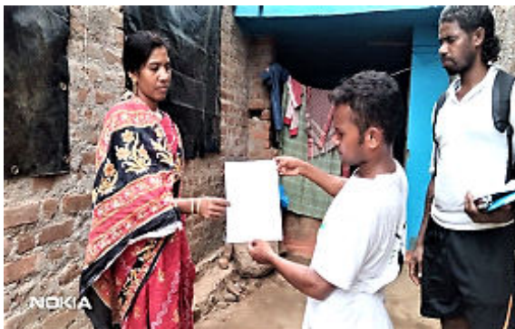
DPO members are facilitating to receive medical certificate