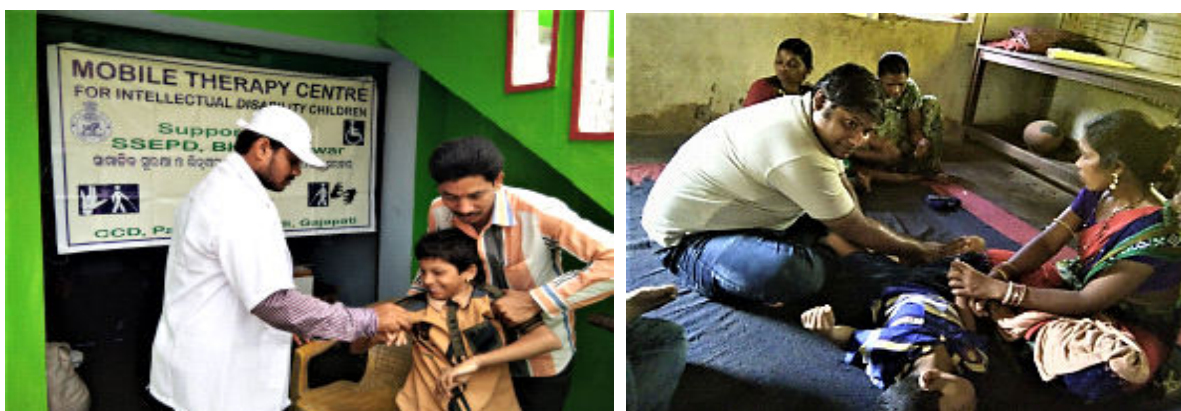
Therapy exercise is going on by our physiotherapist and Govt. physiotherapist

Therapeutic and Rehabilitative services to intellectual disability children has been initiated by CCD with the support of SSEPD, Government of Odisha. 41 children with intellectual disability children have been identified and providing therapy services and also training to the parents on therapy exercise to continue the exercise to their children. Weekly 4 - 5 time therapy services rendering to the children. Credit support is being provided to the parents of intellectual disability children for their financial rehabilitation. Our physiotherapist is making home visits to provide therapy and time to time we are also hiring physiotherapist from government hospital for better services and linking to government provisions.