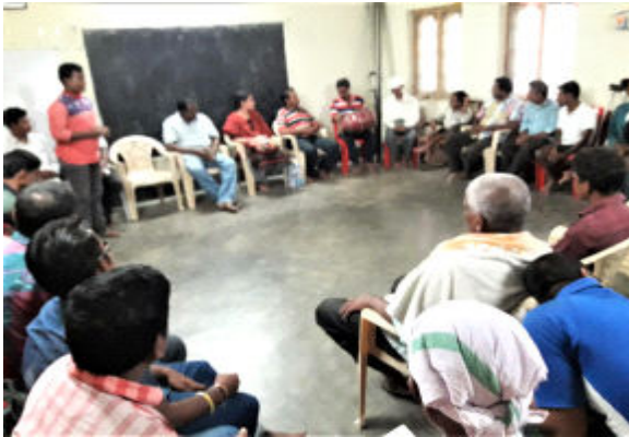
District level conference of SAMARTH