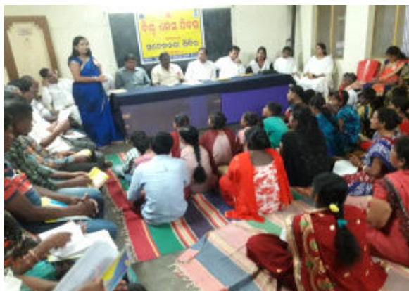
World AIDs Day