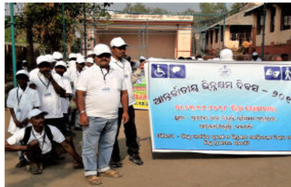
World Disabled Day