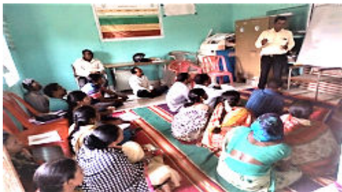
Project Implementation and Monitoring committee meeting