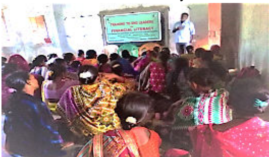
Training to SHG members on SHG management and Financial Literacy