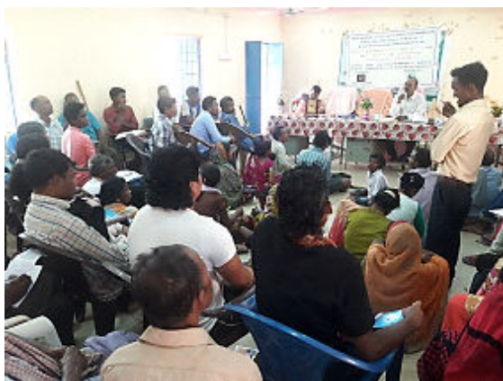
Training to SHG members on Financial Literacy and financial inclusion