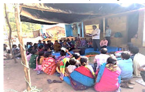
Training to women farmers on organic farming