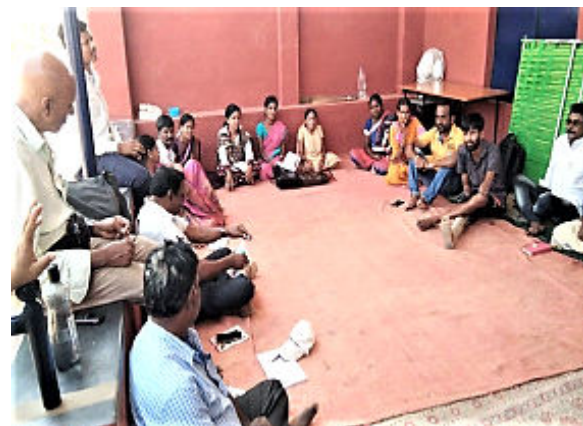
Exposure visit to Timbaktu, Andhra Pradesh