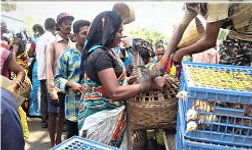
Distribution of relief materials to TITIL cyclone affected families