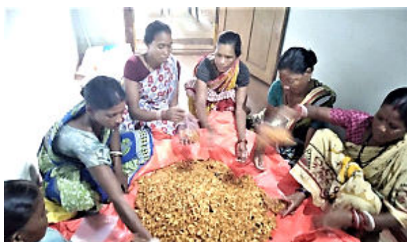
Cooperative members are doing seasonal business