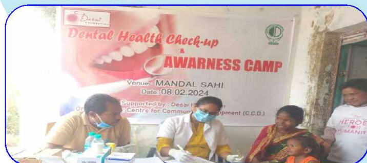
Dental Health Check up and Awareness Camp