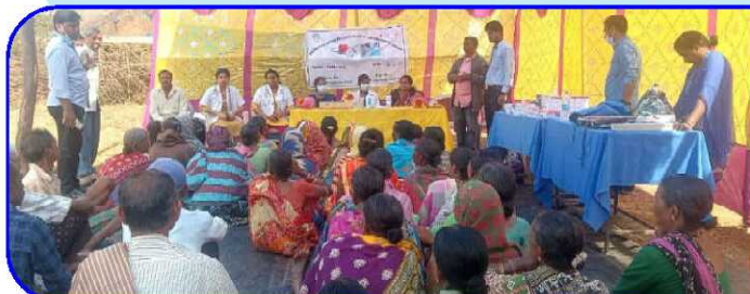
General Health Check up and Awareness Camp

Health & Hygiene measures has been adopted by 4072 women and 454 adolescent girls. Bio-degradable and reusable Sanitary pads has been used by 3836 women and 431 adolescent girls.