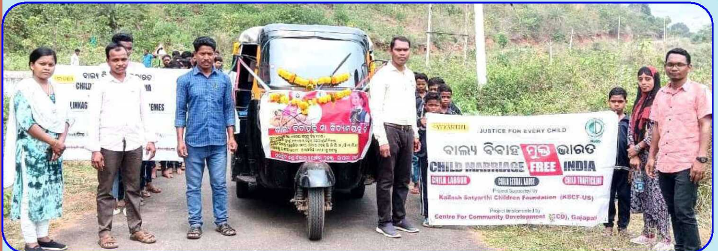
Community Awareness on Child Marriage, Child Labour, Child Trafficking and POCSO Act through Rath Campaign involving Panchayatiraj Institution Members, Religious leaders and other Stakeholders