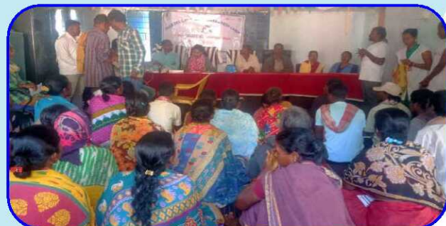
Diebetec Check up and Awareness Camp