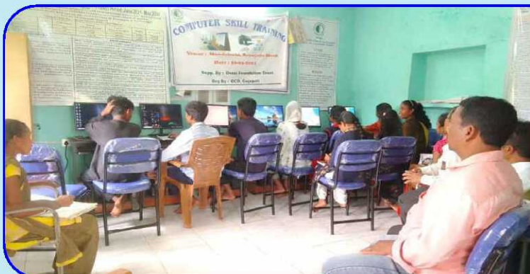
Computer Skill Training