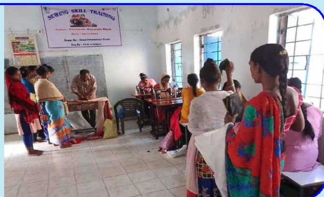
Sewing Skill Training