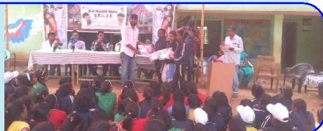
Bal Health Mela