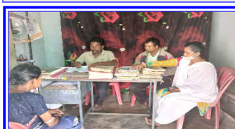
Savings and Credit Activities by Mahendragiri Women Cooperative Ltd