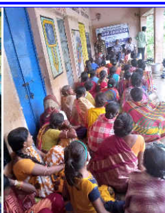
Training to Women SHG members on Organic cultivation