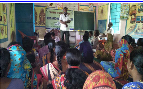
Training to Women SHG members on best Agronomic practices