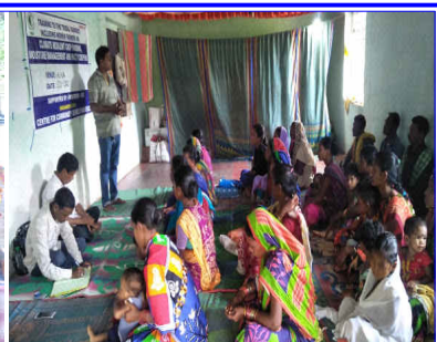
Training to Mahendragiri Cooperative members on Climate resilient crops & Moisture Management