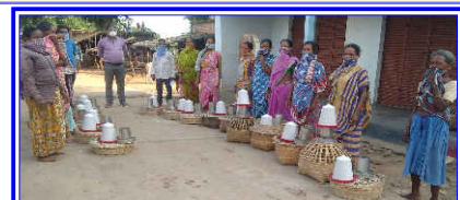
With the convergence from ITDA through FADP, 25 farmers received 875 Cashew Sapplings & 14 families got 140 Chicks