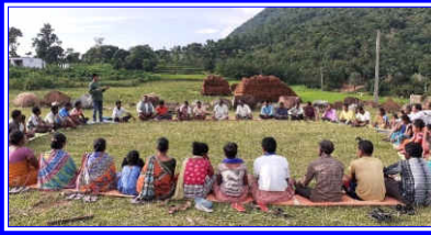
Village level meeting to community to aware on the project Goal of KKS and Baseline Survey to implement the planned activities