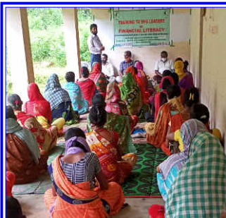
Training to Women SHG members on Financial Literacy

Baseline Household survey and Micro planning was held in 50 target villages. The Community members were oriented on Micro planning tools to enable them in preparing village development plan with their active participation.