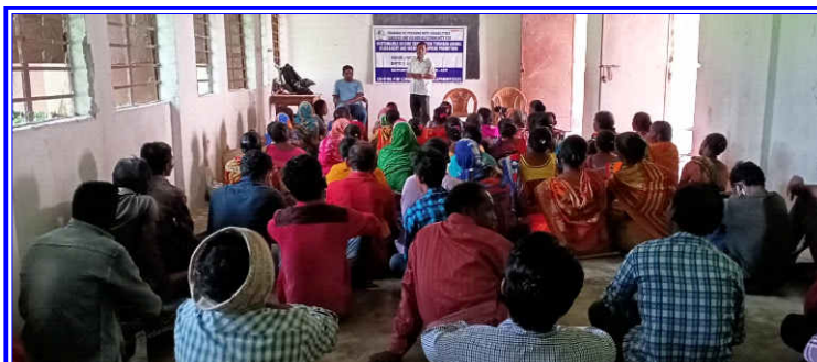
Training to Community Members on Livelihood promotion through Livestock rearing and Management