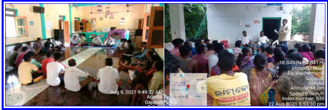
Village level Meeting to the target community on Project Goal, Objective, Activities and the concept of Local Contribution