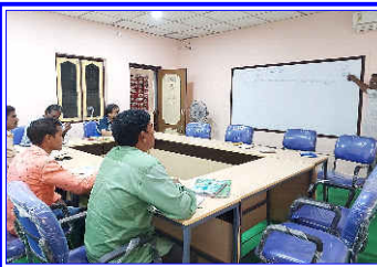
Project Planning & Review meeting by the Director at CCD SMART Training Centre