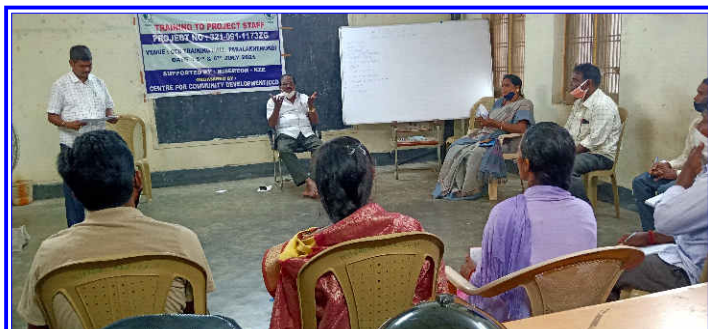
Training to Project Staff on Project Management basing on Project Goal, Objectives, Activities and Impact Indicators