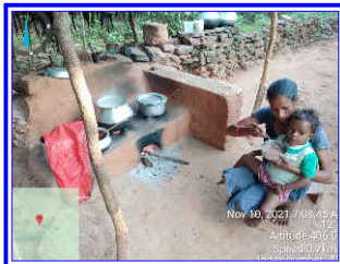
A mother is feeding Ragi kheer to her children - a sign of traditional food practice