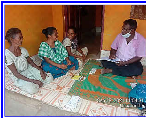
Baseline Household Survey to identify their socio-economic status