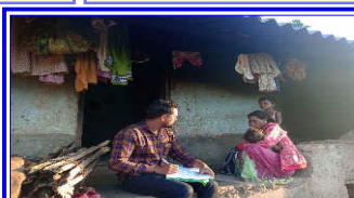
Baseline Household Survey