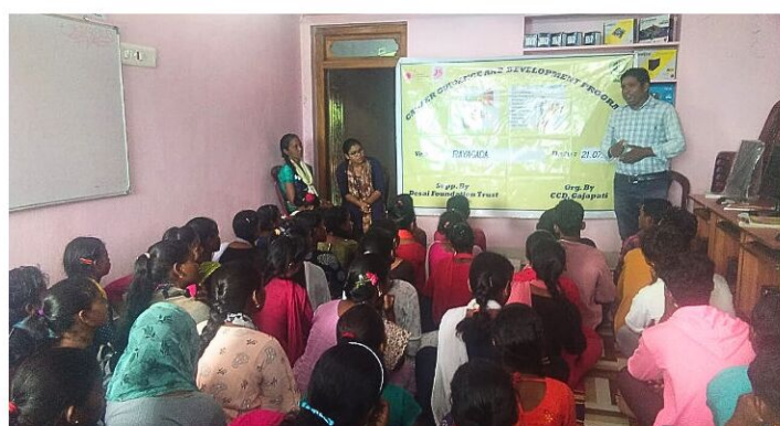
Career Guidance & Development Program