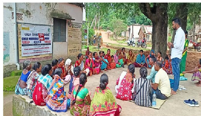
Women SHG meeting to sensitize against Child Marriage and protection the girls from sexual abuses