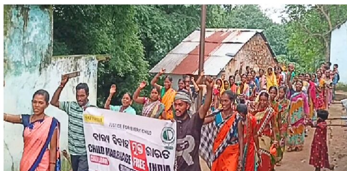
Community Awareness Rally against Child Marriage