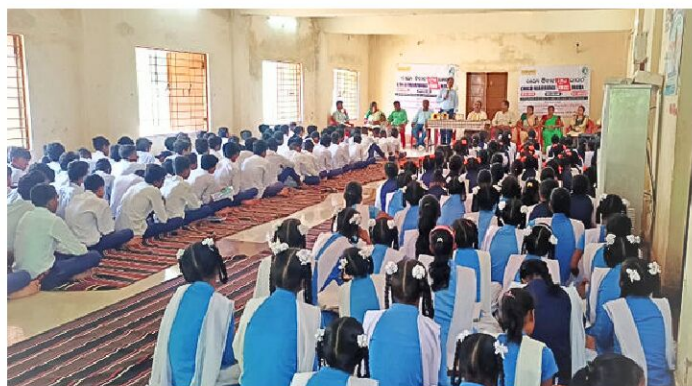
School Awareness program to sensitize against Child Marriage