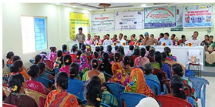
Convergence meeting with Odisha Livelihood Mission