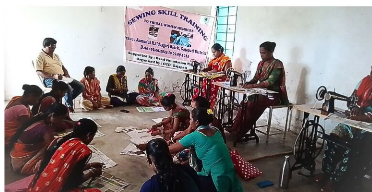
Sewing skill Training

With regular orientation on menstrual hygiene, health and sanitation measures now 24% of Women and 84% of Adolescent Girls are using Sanitary pads during puberty period.