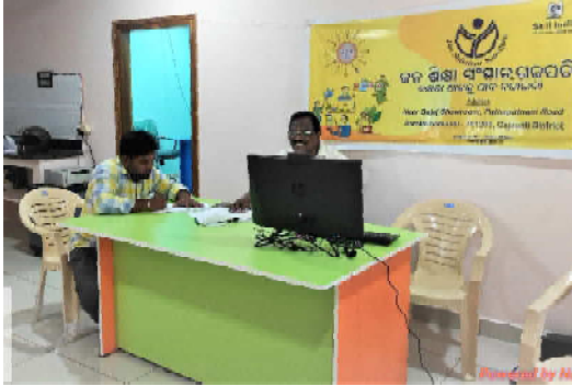
Office of JSS Gajapati

Supported by Ministry of Skill Development & Entrepreneurship, Government of India