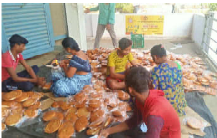
Craft Baker Training

As per the Action Plan Approved by the Ministry of Skill Development & Entrepreneur, Govt. of India total 45 batches to be covered for 900 trainees in 12 trades from October, 2021 to March, 2022. We have organized 8 trades in 28 batches for 560 trainees in the reporting period i.e., Oct-Dec-2021. After successful completion of the trades as per the planned days, the trainees will receive Certificate from the Ministry which will be enabled them for self-employment and eligible to access Bank loan to set up their Enterprises.