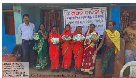
Seed distribution to farmers

611 farmers have cultivated Hybrid Maize in 389 Acres of land in R.Udayagiri and Mohona Blocks of Gajapati. Each farmers have earned the profit of R. 5000/- in an average.