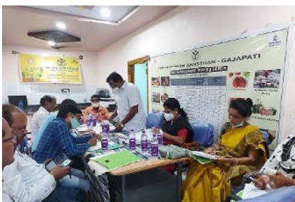
Board of Management Meeting