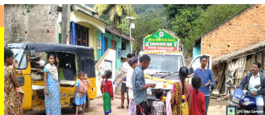
Wider awareness camp at different village level on sustainable practices for Ragi cultivation and household consumption