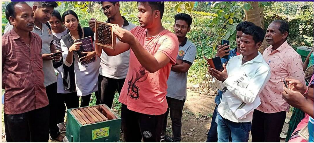
Exposure visit for tribal farmers to Centurion University & Technology Management (CUTM), Gajapati to learn on bee keeping and income generation from honey.