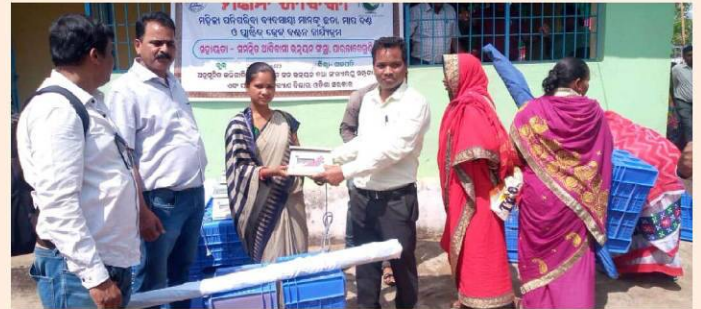
Flour Mill and Wehing machine supported to women SHGs by Mission Jeevika, ITDA throug convergence.